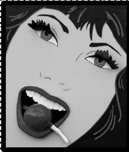
Girl with radish, 1963